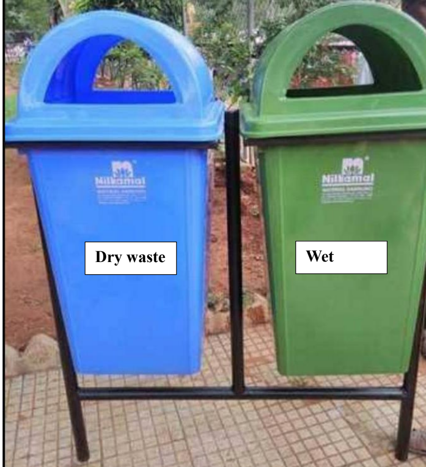
Dry & Wet Dustbins