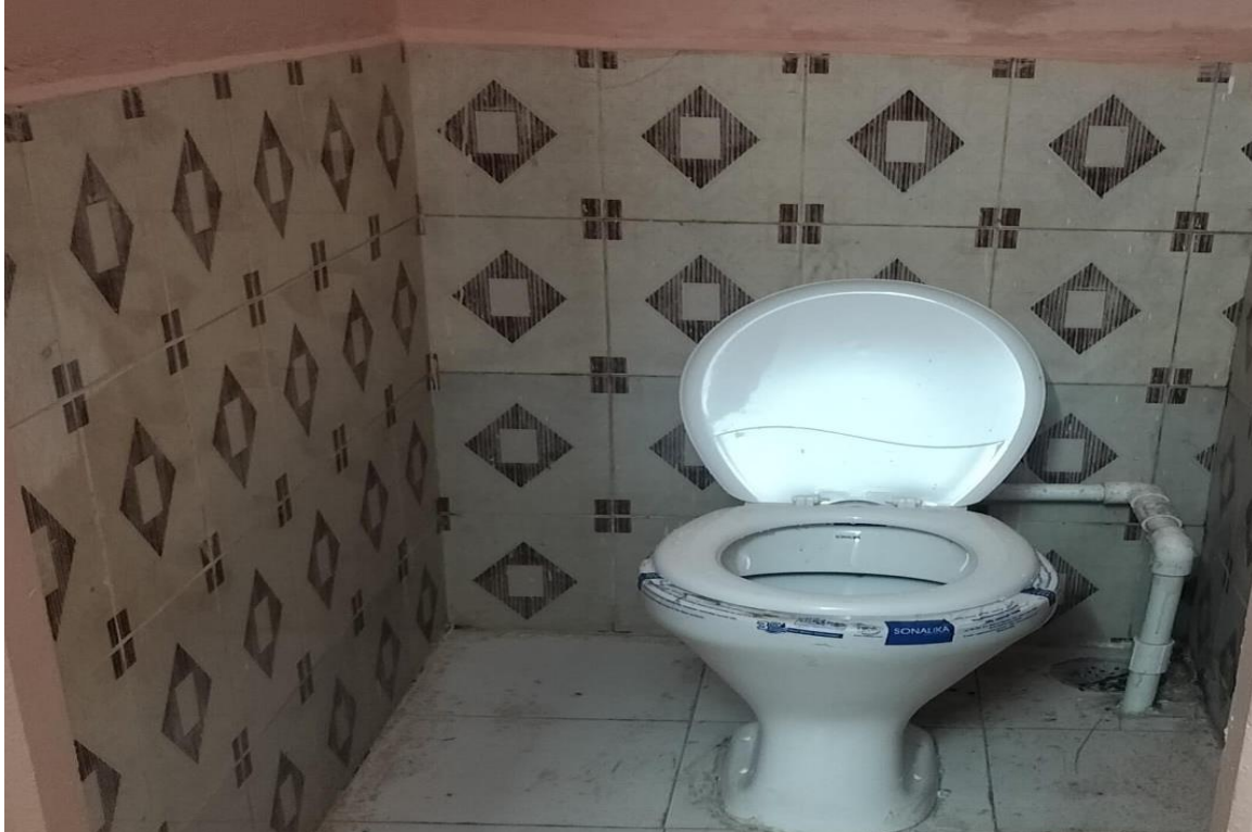
Toilet for Divyanjan

Website : www.ssjiper.com Email :- ssjiper_jamner@rediffmail.com