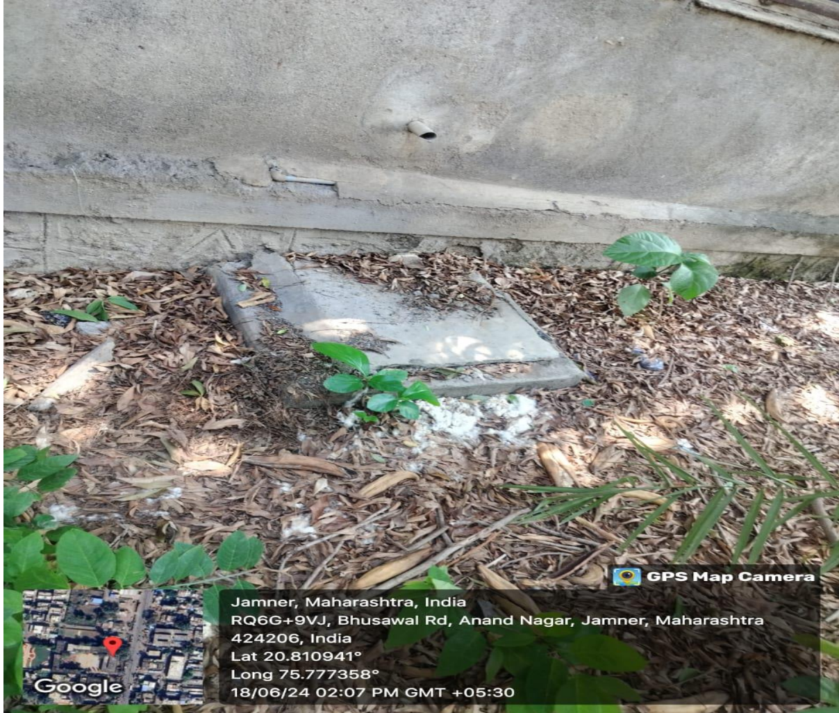
Toilet Water Tank

Website. : www.ssjiper.com Email :- ssjiper_jamner@rediffmail.com