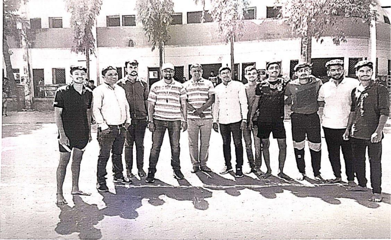
Winner Team Kabaddi

Website. : www.ssjiper.com Email :- ssjiper_jamner@rediffmail.com