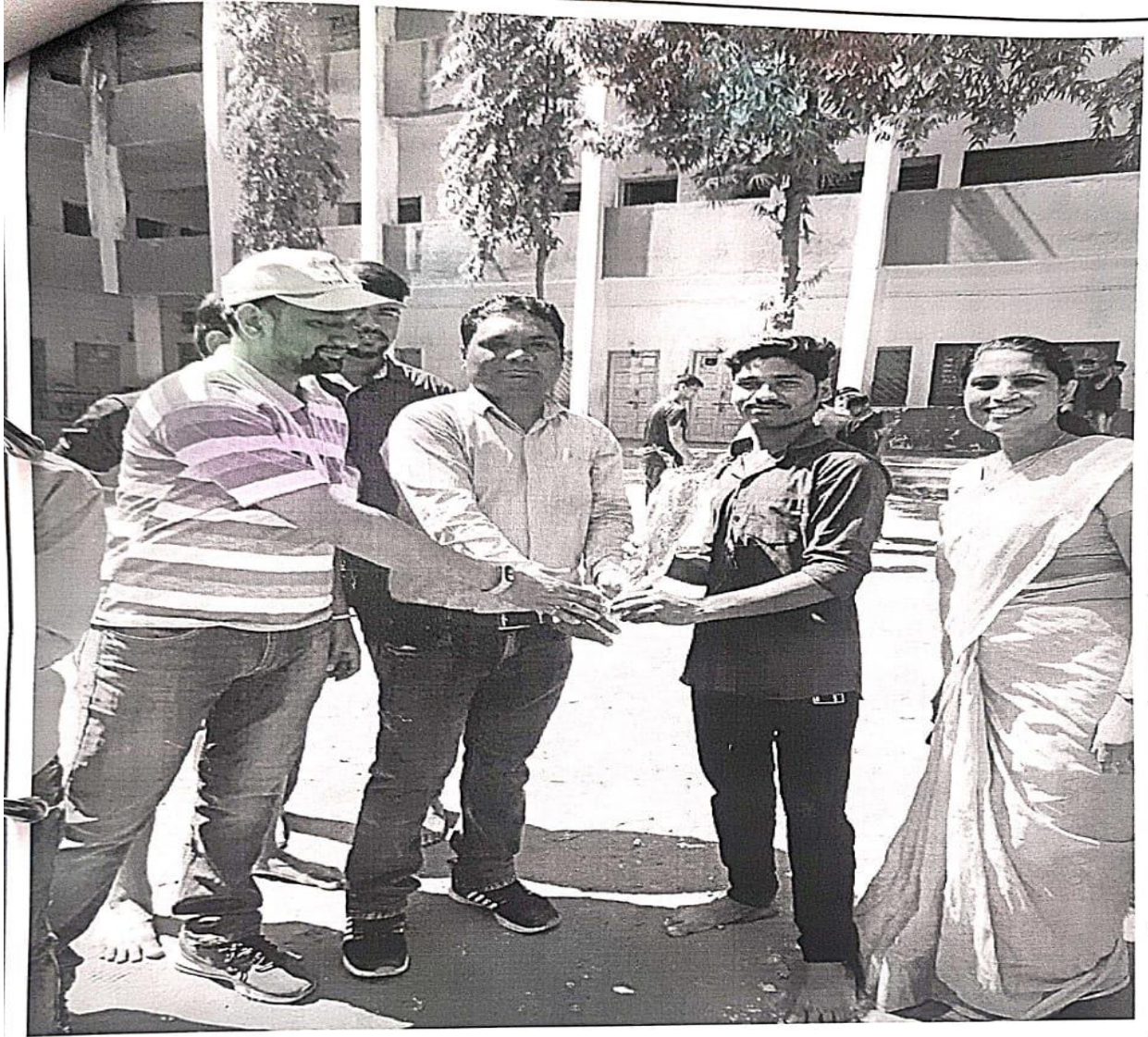
Staff Members With Captain of Winner Team

Website. : www.ssjiper.com Email :- ssjiper_jamner@rediffmail.com